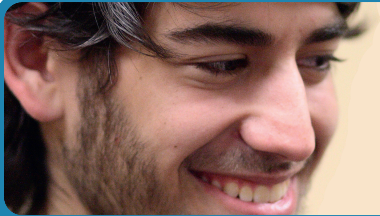
Aaron Swartz, 2009